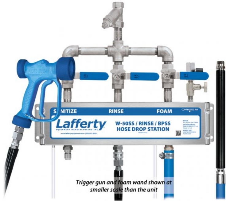
Trigger gun and foam wand shown at smaller scale than the unit

Lafferty EQUIPMENT MANUFACTURING LLC CFS TECHNOLOGIES