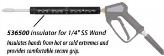
536500 Insulator for 1/4" SS Wand Insulates hands from hot or cold extremes and provides comfortable secure grip.