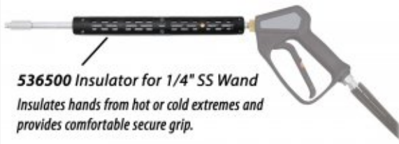
536500 Insulator for 1/4" SS Wand Insulates hands from hot or cold extremes and provides comfortable secure grip.