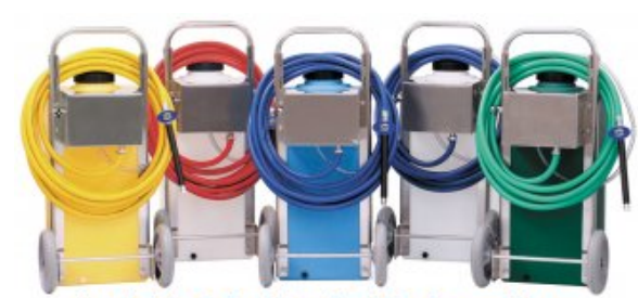
Available Color-Matched Tanks and Hoses

up to 6 CFM Compressed Air Hose 3/4" ID x 40' 50250 Nozzle