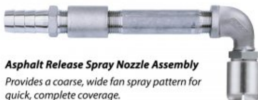
Asphalt Release Spray Nozzle Assembly Provides a coarse, wide fan spray pattern for quick, complete coverage.

Lafferty EQUIPMENT MANUFACTURING LLC CFS TECHNOLOGIES